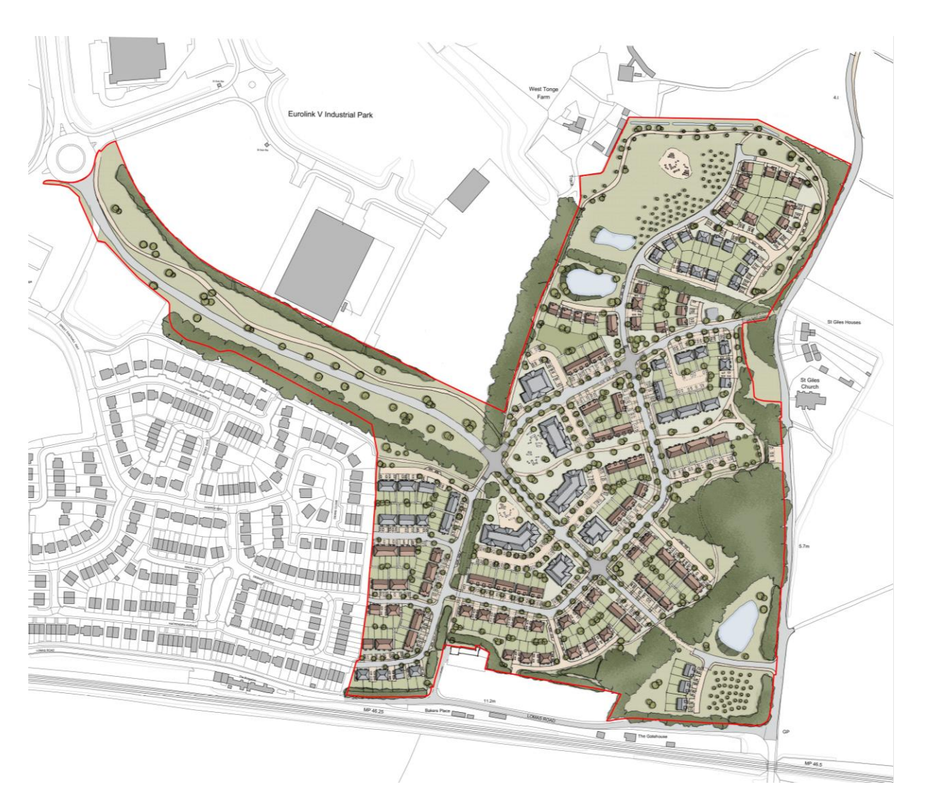
Item 2.2 Land West of Church Road Bapchild Tonge Kent