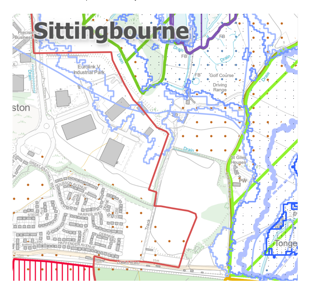
ST3 Built Up Area Boundary (red line)