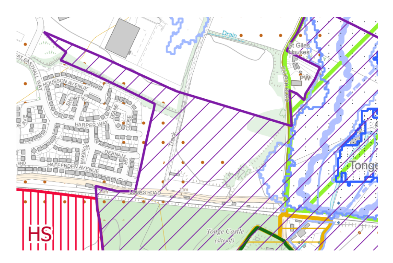
AS1 Sittingbourne Northern Relief Road Safeguarding

In determining its route, environmental mitigation issues associated with the route will be addressed, including the impact of the new road on the traffic flows and living environments along the A2 corridor to the east of Sittingbourne.