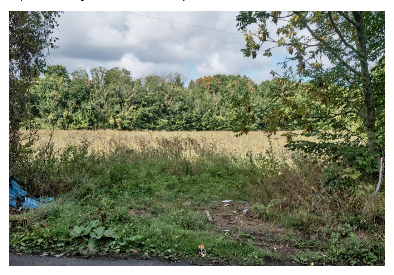
South East Corner of site